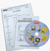
Test report Instruction manual CD