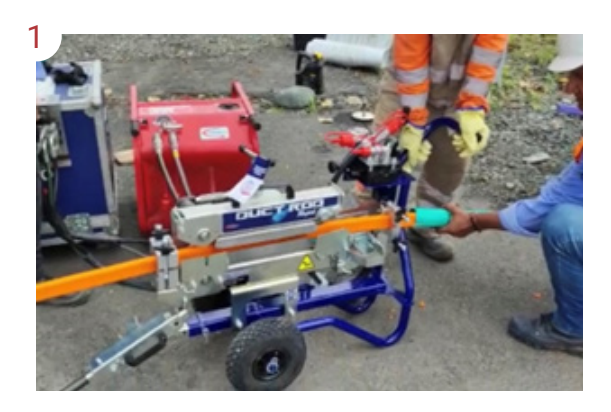
DuctRod RAPID set up with micro duct between chains.

In Columbia, a micro duct was pushed into a concrete barrier using the DuctRod RAPID. It has been proven that if you were to complete the task by hand, it would be difficult and time-consuming and might have required three times as much manpower.