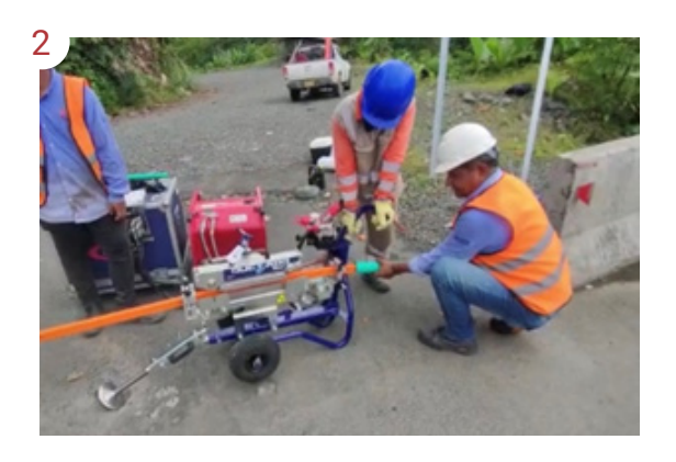
DuctRod RAPID set up with micro duct between chains being guided into the barrier by a technician.