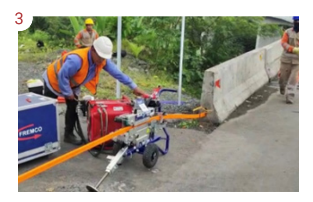
DuctRod RAPID in use pushing the micro duct into the concrete barrier a distance of 280m/306yds