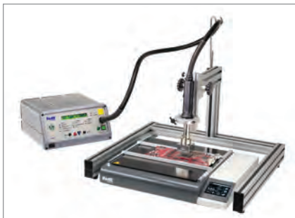
ST 925 Low-Cost Convective and Infrared Station for SMT Rework