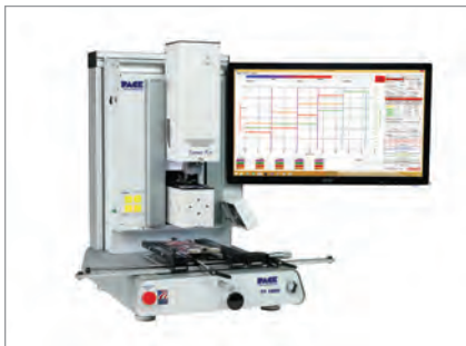
TF 1800 BGA/SMT Rework Station with Inductive-Convection Technology