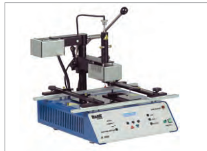
IR 1000 Low-Cost Infrared BGA & SMT Rework Station