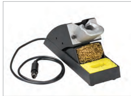
Optional Instant SetBack (ISB) Tool Stand