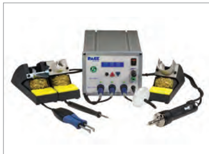
MBT 350 Multi-Channel Solder, Desolder & Rework System