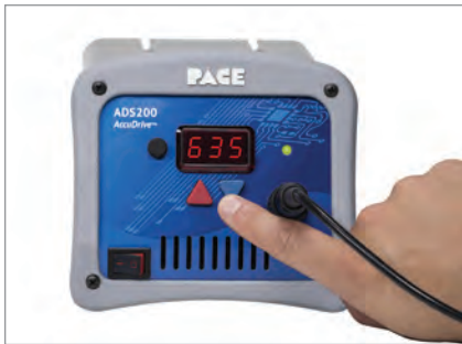
Intuitive and Simple Operation