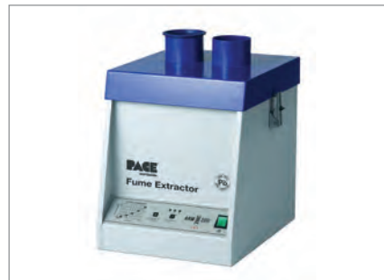
ARM-EVAC 250 Microprocessor Controlled Fume Extractor