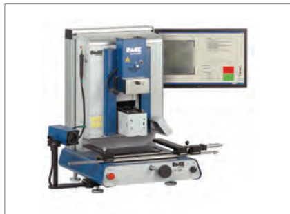
IR 3000 Infrared BGA & SMT Rework Station