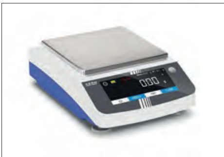
Also available with a larger weighing surface