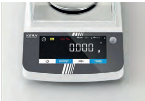
The modern touch display enables convenient operation