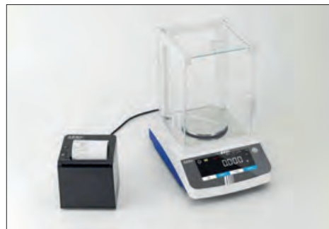
In a GLP-compliant print protocol all weights can be documented, including date, time and identification number.